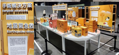
Design Our World