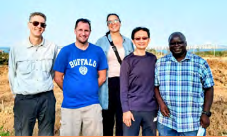
Kinmen Bridge (in the background)

On November 22nd, on our way back to Kaohsiung, we visited the historic Mofan Street. Mofan Street is a street with a lot of historical significance. Mofan in Mandarin means model; the buildings on this street model historical buildings influenced by Western, Fujian, and Japanese architecture.